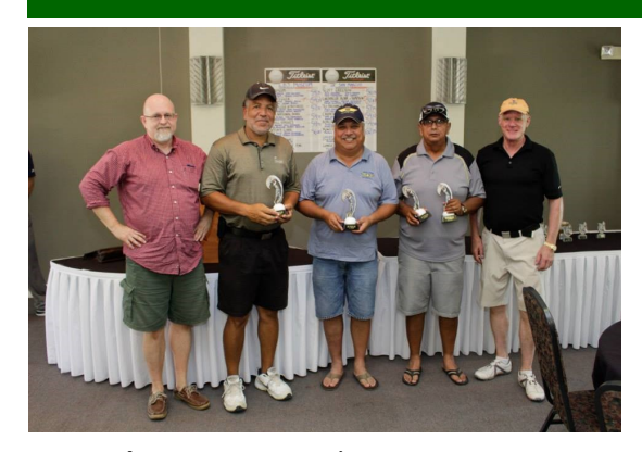
1st Place Team - Linebarger Goggan Blair & Sampson, LLP