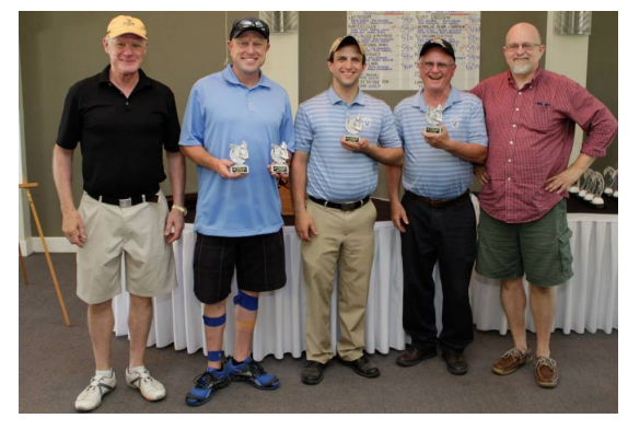
3rd Place Team - Hunters Glen Fellowship